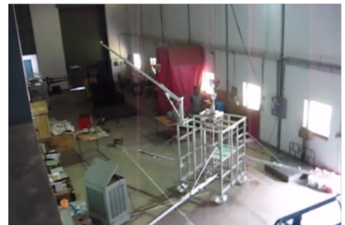
Figure 23: (a) Servo-controller board (b) Balloon gondola with deployed booms

The customer was delivered with the controller board that was readily integrated with the booms and balloon gondola. This integrated probe deployment mechanism is being successfully used by the customer for atmosphere experiments. Due to the integrated and in-house design approach adopted by Zeus Numerix, customer's objectives were realized with minimum cost and time.