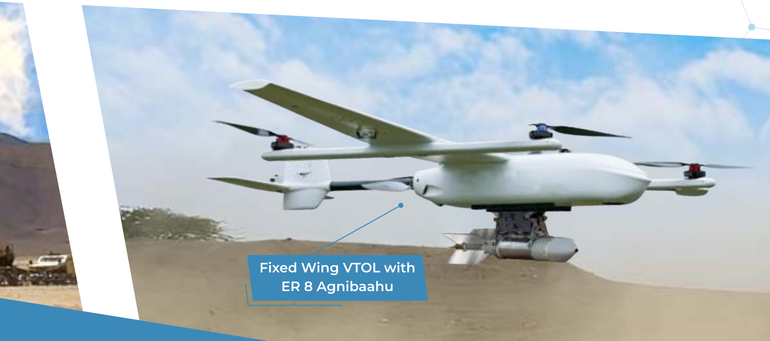
Fixed Wing VTOL with ER 8 Agnibaahu